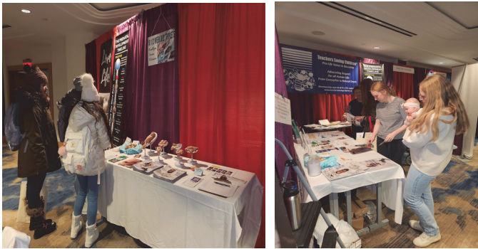
March for Life attendees visit our exhibit

They planned to allow the students to hear the preborn child's heart beating. (Talk about an "outside the box" means of educating students about life in the womb!)