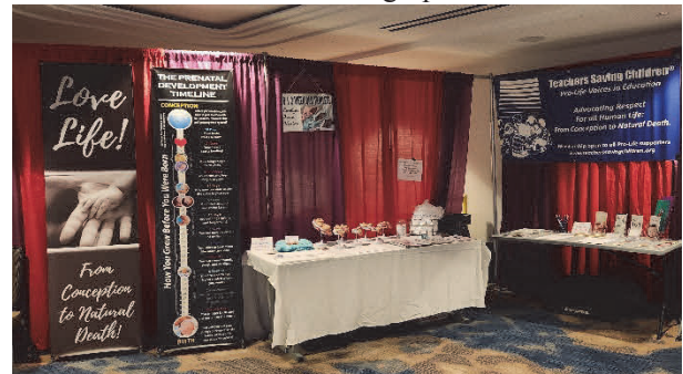
Vertical banners: “Love Life from Conception to Natural Death” & “Prenatal Developmental Timeline”

An eye-catching item at our display were two “vertical” free-standing banners (see photo). Both banners received much attention from attendees throughout the Expo. We observed numerous persons taking photos of the banners or posing with them for a photo. We had a mother and her teen-age son relate (as they observed the banner regarding fetal development) that he had wanted to make a poster with similar information for a project at his Roman Catholic high school but had been refused permission because “it might offend someone.” On a lighter note: late on Wednesday evening, a crew from Heritage House came past, and the gentleman who’d designed that banner asked if we’d like him to autograph it!