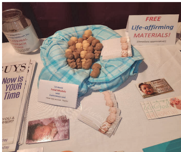
12-week preborn baby models

Most popular for attendees were the soft twelve-week preborn baby models. Over 200 of these were taken! High school and college students, the self-described Pro-Life Generation , visiting our exhibit marveled at, were most interested in, these preborn baby models. A card detailing the child’s development up to that stage accompanied the models. Also popular were pro-life books Judy Bruns had written and published. We brought home very few of those we had taken.