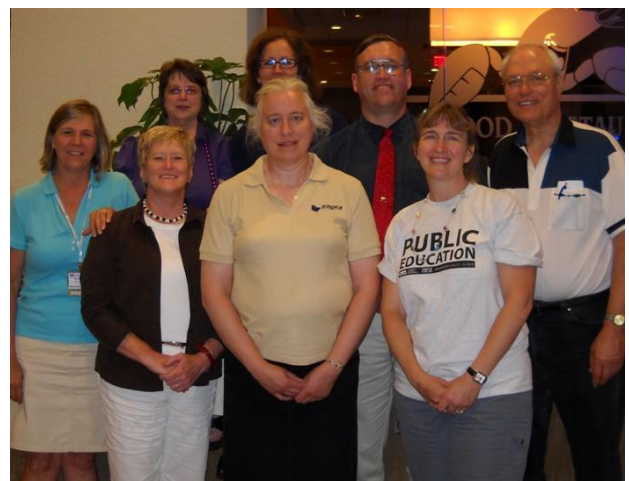
Conservative educators from across the United States who were in New Orleans during the NEA Representative Assembly.

The Association also urges the implementation of community-operated, school-based family planning clinics that will provide intensive counseling by trained personnel." (1985, 1986).