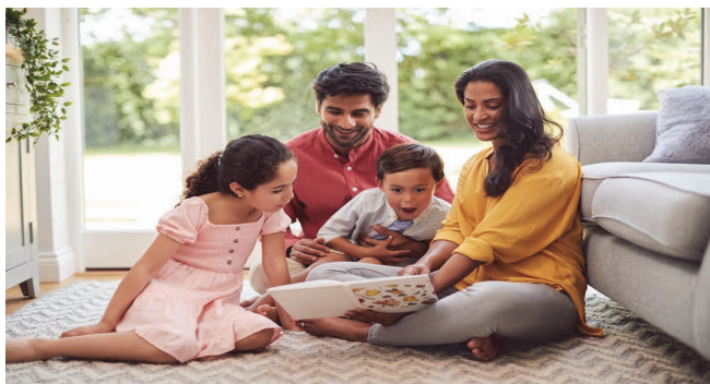
Family Time Together...Memories Being Made

As summer winds down, and preparations for returning to school ensue, memories of summer activities will return to children and their parents in future years.