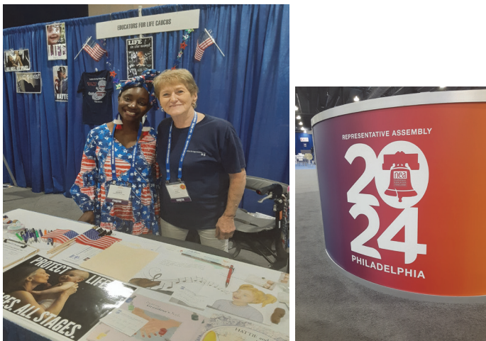
Awesome Pro-Life Advocates at the NEA-RA

“The Light shines in the darkness, and the darkness has not overcome it.” —John 1:5