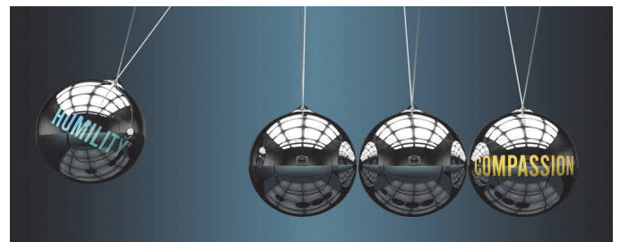
Humility Leads to Compassion

Conversations about these values are powerful. Our actions speak volumes. Together our conversations and actions are most effective in helping guide and shape the development of values in children.