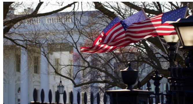
American Flags at the White House

Trump, on the other hand, campaigned on leaving the abortion issue to the states and eliminating the Biden-Harris policy of allowing minor children to make their own transgender decisions with no input from the parents. Trump also promised to restore religious liberty protections, specifically in education and the medical field. We need to make sure that President-elect Trump follows through on his promises. During his first term, Trump was the most pro-life American president ever.