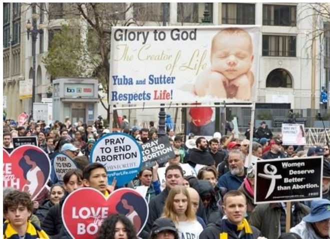
March for Life (in California)

Organizers will not have a 3-day Expo, as in years past, a very positive experience for our Teachers Saving Children exhibit and attendees. Now the focus is branching out to the individual states where a state March for Life will be held in the state’s capital. By marching in state capitals across the country, we show our local leaders that we the people want protective, life-affirming laws for both the unborn and their mothers.