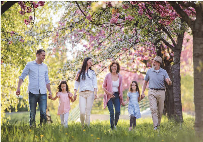
Family's 3 generations enjoying the beauty of spring

Spring is a beautiful season as daylight hours grow longer, winter cold vanishes, flowers bloom, and new growth appears in the landscapes around us.