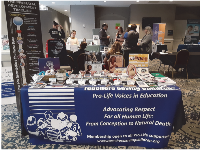
Teachers Saving Children exhibit