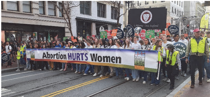
Walk for Life West Coast, 2025....

The theme for this year's 21 st annual Walk for Life West Coast was “ Reclaiming Life for Every Generation ”. Thousands of pro-lifers gathered on the plaza in downtown San Francisco, beginning at 10 am, visiting 24 different pro-life groups each of whom were allowed to have a pro-life table exhibit. Teachers Saving Children had a beautiful exhibit with baby models, life-affirming books, pro-life stickers and various fact sheets and posters, “Life-Savers” candies and pro-life pens. Our table was once again one of the most-visited (if not the most-visited) exhibits.