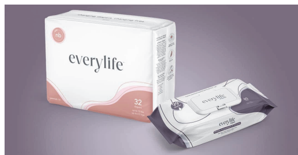
Every Life , a pro-life diaper company

On February 8 th , Teachers Saving Children donated over 1,500 diapers to the Made in His Image pro-life event in Canton for distribution to the local pregnancy help centers. We purchased the diapers from Every Life , the pro-life diaper company. (Huggies, Luvs, and Pampers all donate to Planned Parenthood and pay for abortion travel expenses).