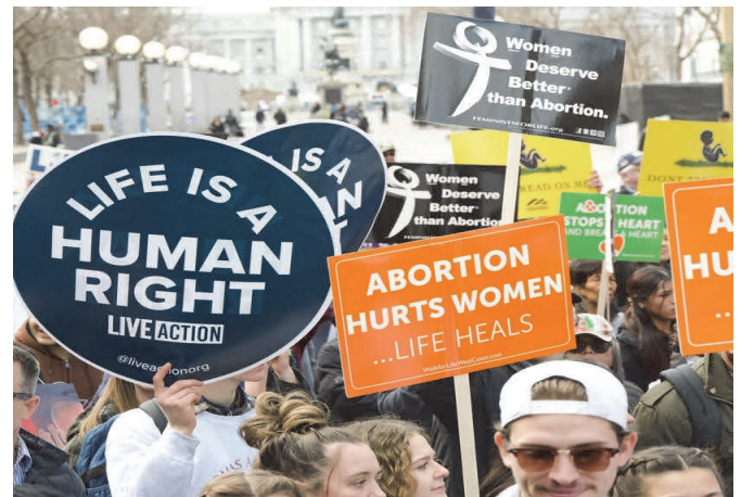
Walk for Life West Coast

We enter spring following a very active winter outreach. On pages 2 and 3, you will find a summary of 3 different outreach events in which we participated: Walk for Life, West Coast (San Francisco); Made in His Image (Canton, Ohio); and Bringing America Back to Life Convention (Independence, Ohio).