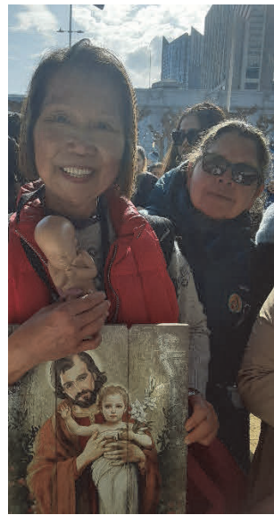
Mother remembering with a baby model Sign reads: “Our Salvation Began with an Unplanned Pregnancy”