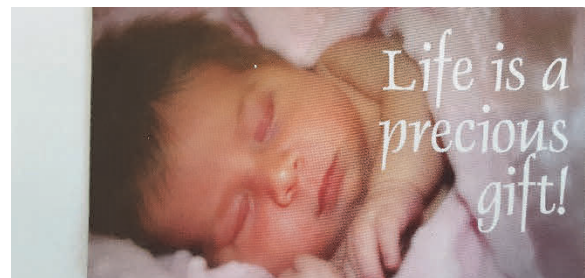
One of the popular magnets