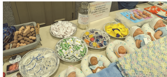
Exhibit table at Made in His Image Event

On Saturday, February 19 th , the Heritage Reformed Baptist Church, in Canton, Ohio hosted Made in His Image 2022 , a pro-life event hosted by Christian men who believe the Gospel of Christ is the solution and the first line of defense against abortion. This annual pro-life event features guest speakers and pro-life groups advocating for the protection of human life, especially mothers and their children.