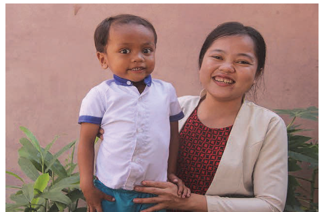
Mother and Son

You are an unrepeatable creation; a gift of life and love.”