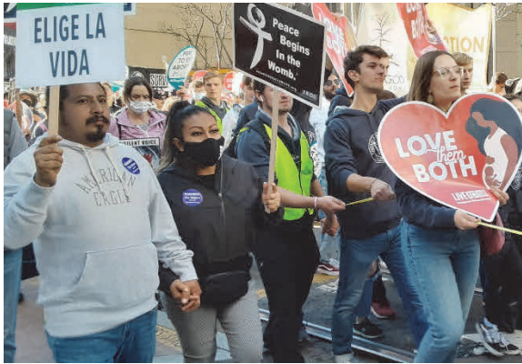
West Coast Walk For Life (“Elige La Vida” means “Choose Life”)

On Saturday, January 22, 2022, 49 years after the U.S. Supreme Court Roe v. Wade decision, more than 15,000 pro-life Americans participated in the 18 th annual West Coast Walk for Life in San Francisco. Compared to the cold temperatures the day before in Washington, D.C for the March for Life , participants in San Francisco were blessed with temperatures in the mid-60's and sunny skies.