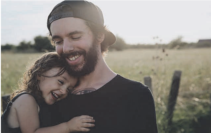
Father and Daughter

The theme for this year’s March for Life was “ Equality begins in the womb ”. It is with no small irony that Biden has cemented his place in U.S. history as the most pro-abortion President ever, ignoring the rights of the most vulnerable human beings, our preborn brothers and sisters in the womb.